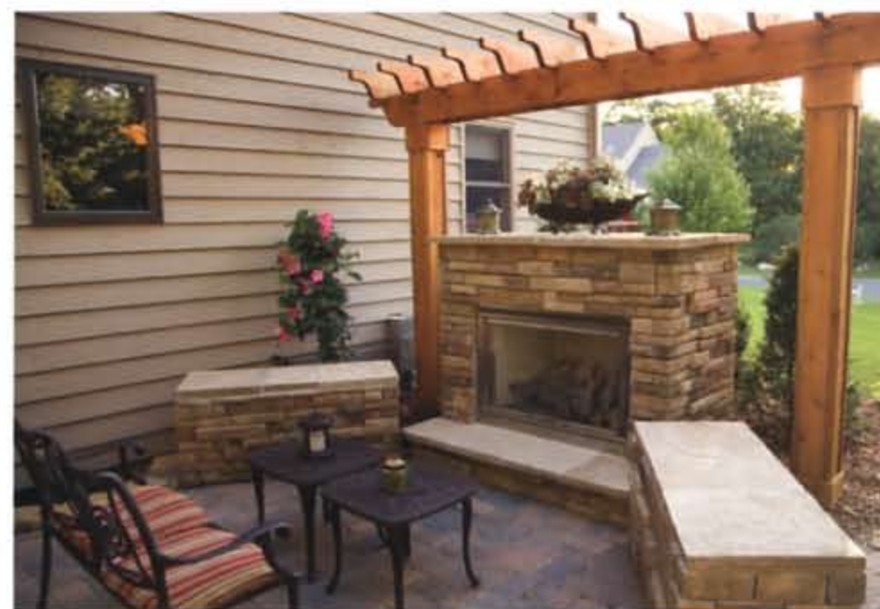
Above top: The 760-square-foot patio has three distinct living areas.